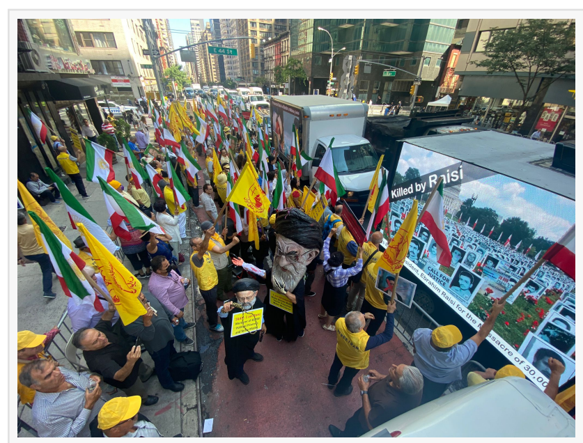
Iranian American supporters of the National Council of Resistance of Iran (NCRI) protest near Raisi's hotel in New York City, September 20, 2022

This press release can be viewed online at: https://www.einpresswire.com/article/593418890 EIN Presswire's priority is source transparency. We do not allow opaque clients, and our editors try to be careful about weeding out false and misleading content. As a user, if you see something