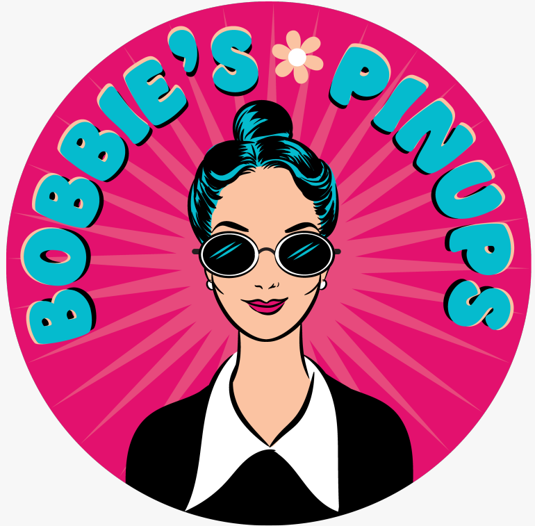
Bobbies Pinups Logo color