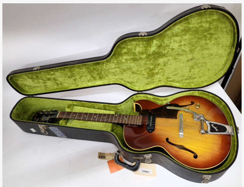
Gibson ES175 Sunburst electric guitar (no serial number), with factory Bixby whammy bar, dark swirl pick guard and hard case (est. $5,000-$10,000).