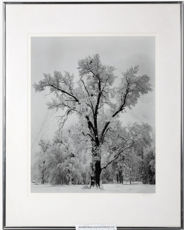
Mammoth framed Yosemite print of a snow-covered tree by Ansel Adams, circa 1959, signed lower right in pencil by Adams, 19 inches by 15 ½ inches less frame (est. $5,000-$9,000).