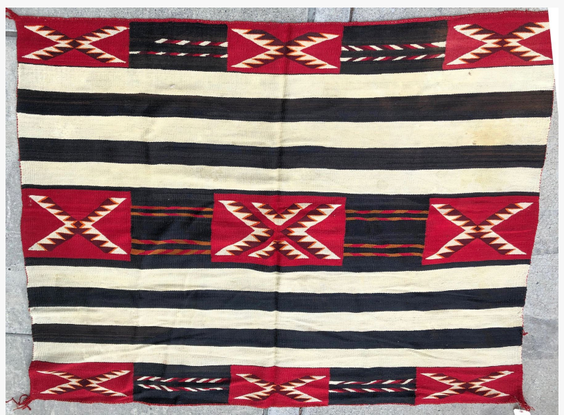
Beautiful, circa 1900 red Mesa Chief pattern rug, 6 feet by 6 feet 5 inches, in generally good condition with no major defects (est. $5,000-$7,000).

RENO, NV, UNITED STATES, September 29, 2022 /EINPresswire.com/ -- Collections and categories will be plentiful and on full display at Holabird Western Americana Collections' massive four-day Western Frontiers auction being held October 13-16, online and live in the Reno gallery at 3555 Airway Drive. The 2,100-lot sale will feature Native and general Americana, mining, Express, numismatics, art, bottles, stocks, and more.