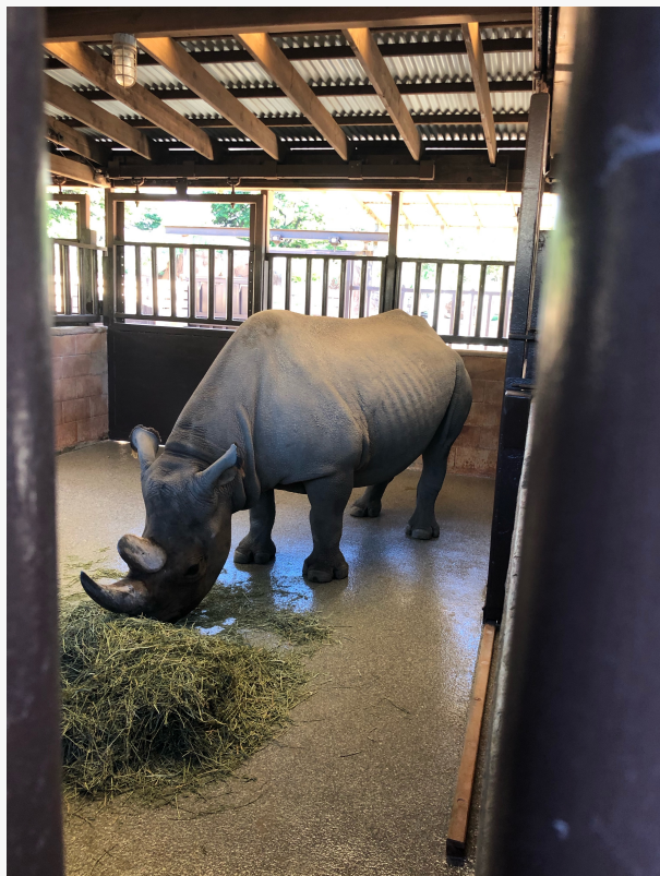
Black Rhinoceros, named Aria