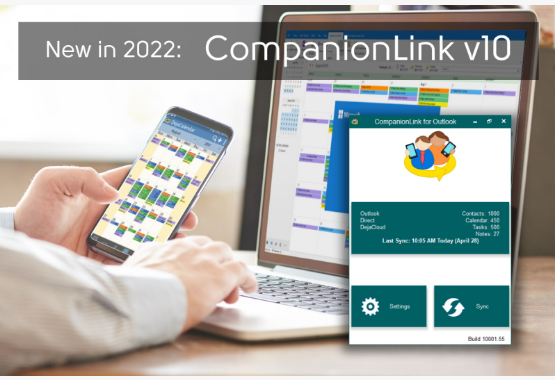
CompanionLink v10 for Outlook, Android, iPhone sync