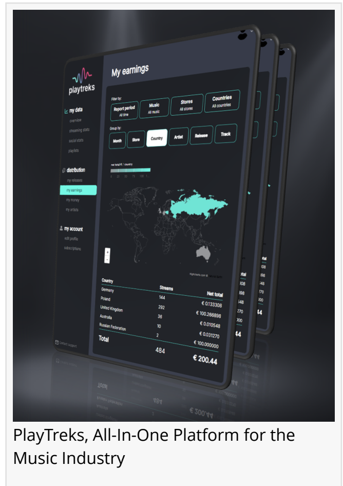
PlayTrekks, All-In-One Platform for the Music Industry

Serving thousands of Do It Yourself, Indie artists and record labels daily, PlayTrekks, since its inception, is enjoying rapid growth. Established in 2020, and live since late April 2021, the Belgium and United Arab Emirates-based company is traversing music distribution, data analytics, airplay monitoring, and a blockchain-based marketplace. Since then, the pre-Series A company has been quietly attracting indie artists to its music NFT marketplace to spur greater revenues and