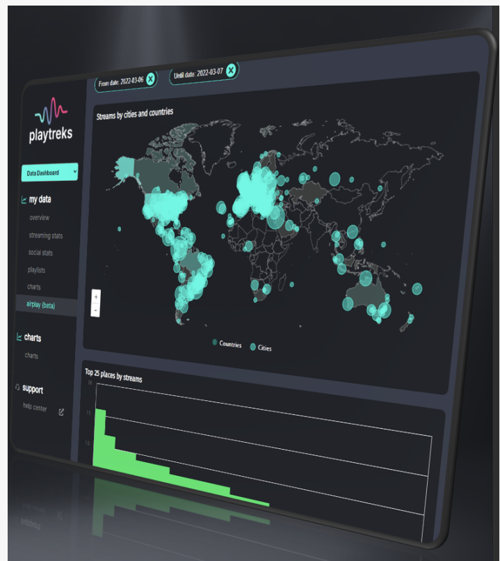
PlayTreks, All-In-One Platform for digital content creators

This press release can be viewed online at: https://www.einpresswire.com/article/593503305 EIN Presswire's priority is source transparency. We do not allow opaque clients, and our editors try to be careful about weeding out false and misleading content. As a user, if you see something we have missed, please do bring it to our attention. Your help is welcome. EIN Presswire, Everyone's Internet News Presswire™, tries to define some of the boundaries that are reasonable in today's world. Please see our Editorial Guidelines for more information. © 1995-2022 Newsmatics Inc. All Right Reserved.