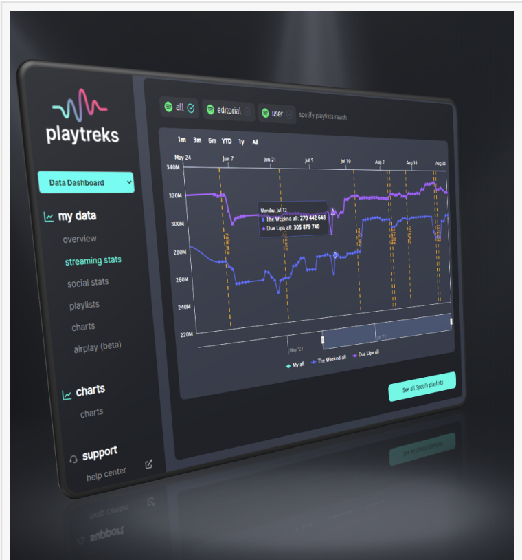
PlayTreks, All-In-One Platform for Artists

Japan and the UAE enjoys friendly relations and trade since 1971, when the two countries established diplomatic ties. Japan's CEATEC is similar to CES and IFA in terms of scale and scope of the show.