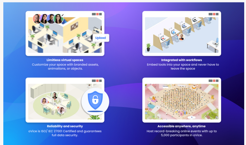
Features of oVice