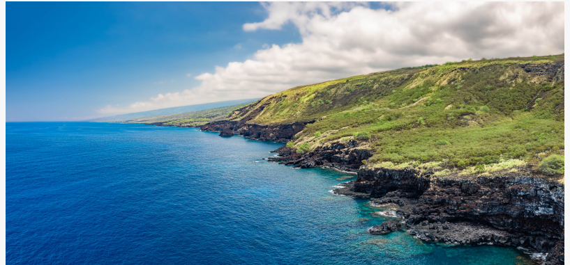
Potential for up to 13 estates with unobstructed ocean views