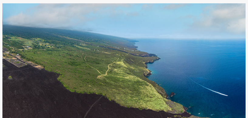
1± mile of ocean frontage on Hawai'i's western coast

As you approach Pali Kai, the green landscape transforms to the rich azure blue of the Pacific, stretching farther than the eye can see. Its location in the center of the Kona Coast ensures incredible weather and minimal, gentle winds year-round, making the perfect vistas all the sweeter. Meanwhile, the secluded black-sand beach offers a remarkable setting to enjoy seaside