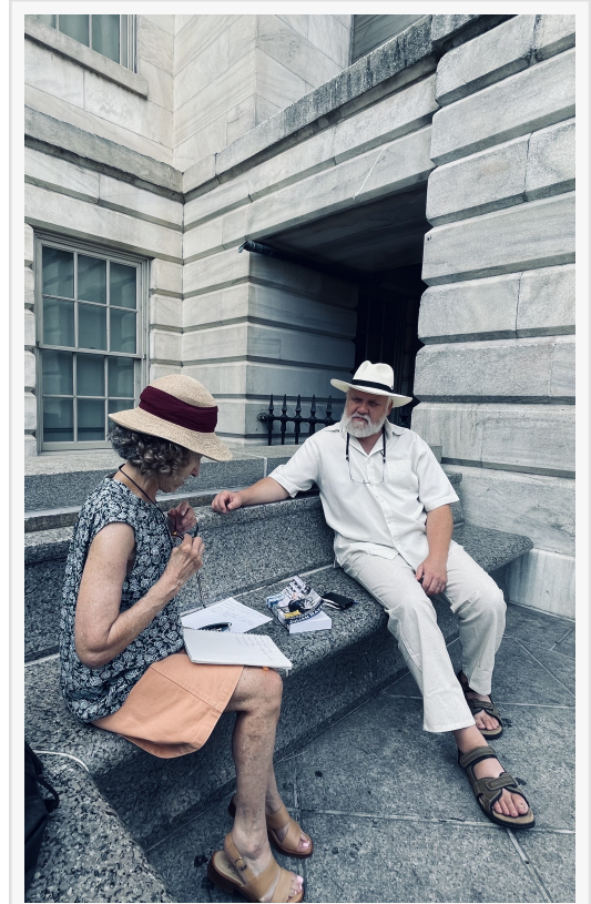
An interview at the Smithsonian National Portrait Gallery