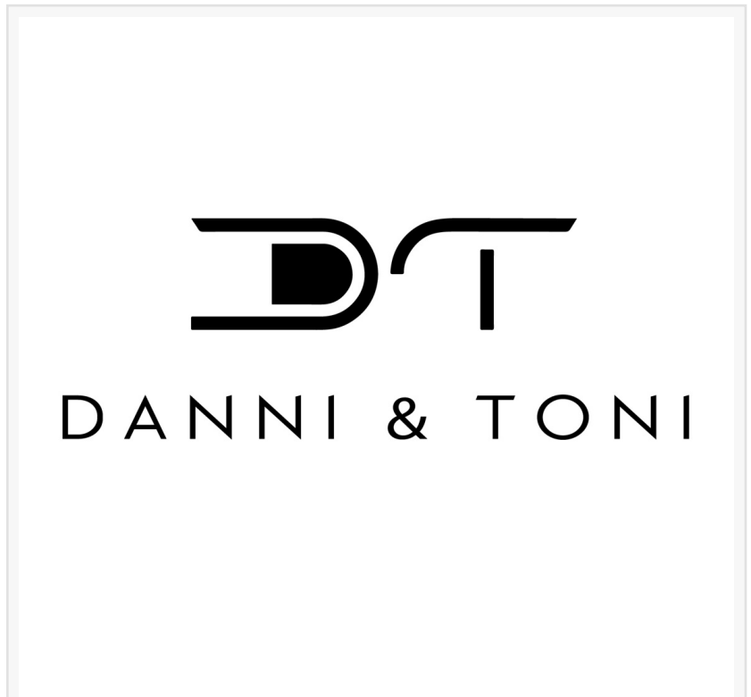
Danni & Toni Logo

Besides the glow-in-the-dark nails , there are also a number of other spooky designs, including monsters, mummies, blood, and more. If these are a bit too intense for you, you can also find a