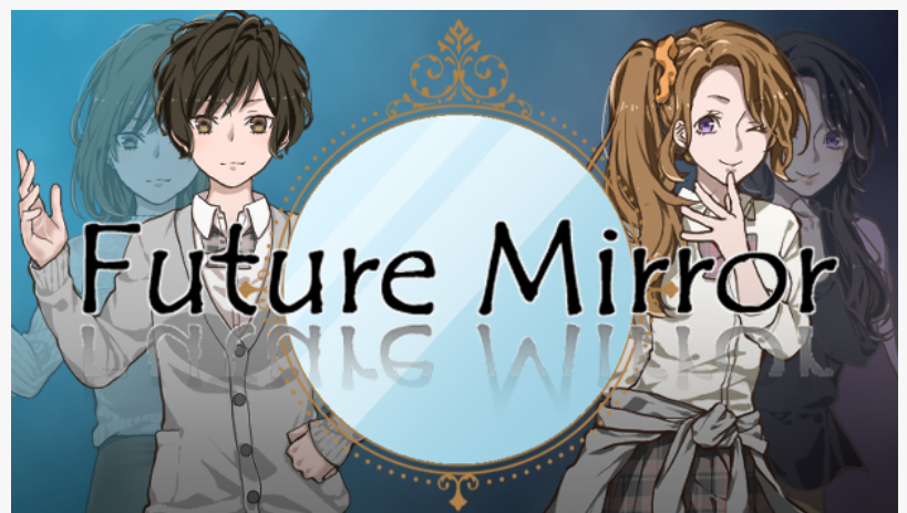
Future Mirror Main Image

“I enjoyed the comical and fast-paced dialogue.”