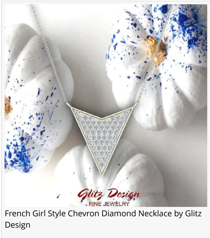
French Girl Style Chevron Diamond Necklace by Glitz Design