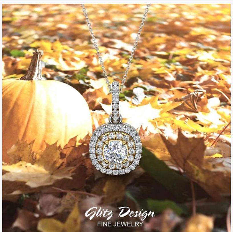
Diamond Jewelry to suite the French Girl Style Aesthetic

This press release can be viewed online at: https://www.einpresswire.com/article/593844693