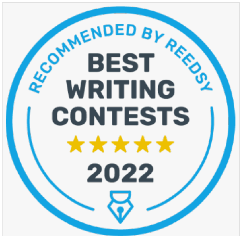
Best Writing Competition