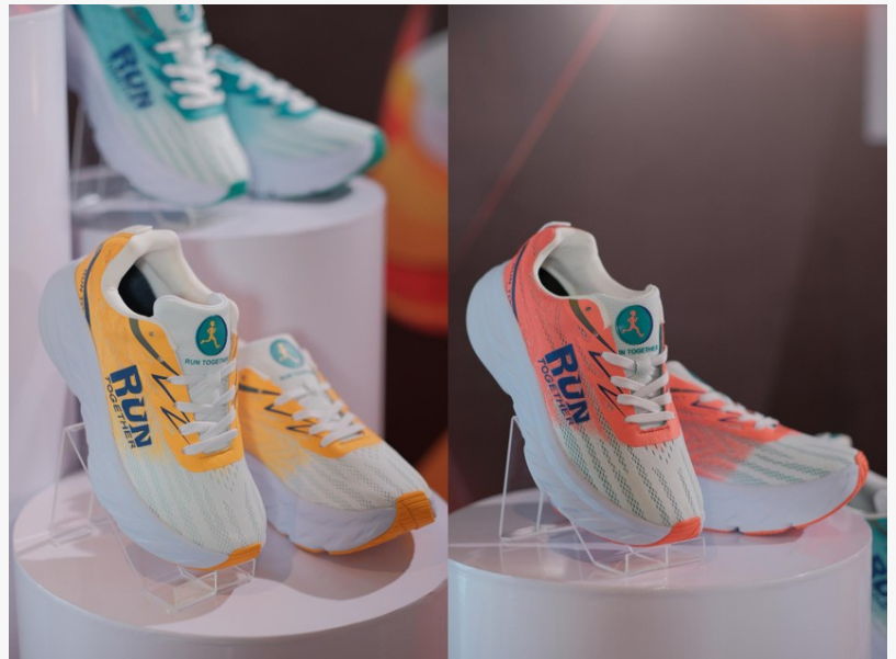
The Vietnamese first physical shoes applying NFC technology launched in June 2022.