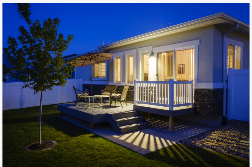
Accessory dwelling unit