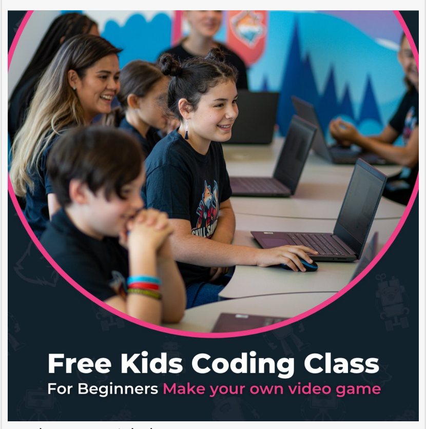
Book a Free Trial Class

Coding, Robotics, and Artificial Intelligence classes around the world. Skill Samurai prepares students for the jobs that will be in demand in the future by focusing on real programming