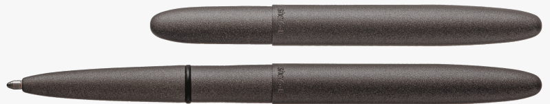
The Fisher Bullet with a tungsten colored Cerakote coating