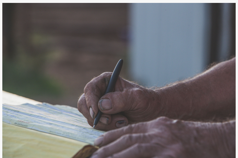
The Fisher Bullet in use covered in Cerakote Armor Black coating

Cerakote® by NIC Industries offers the answer to these questions. Fisher Space Pen has teamed up with NIC Industries to present two of Fisher classics in a fresh light. Cerakote is an innovative coating technology using ceramic and polymer to create a thin layer on any hard surfaces including but not limited to plastic, hardwood, polymer, and metal. This coating method provides a superior shield against corrosion, abrasion, and wear to any other coatings available in the industry. Moreover, Cerakote coating is easy to apply and comes in hundreds of unique colors to make any product enduring and visually appealing. As a result, the combination of Cerakote and Fisher delivers enhanced functionality and design all around.