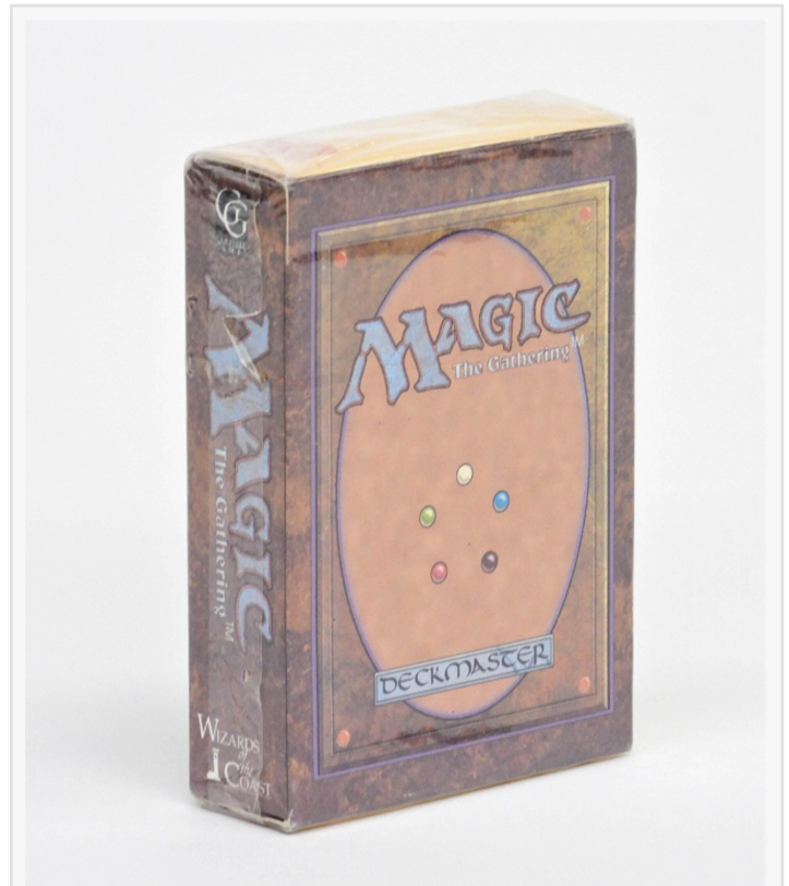
Factory-sealed 1993 Magic: The Gathering Beta Edition starter deck, possibly containing a Black Lotus, Ancestral Recall, Timetwister, Power 9 or Volcanic Island (est. $15,000-$25,000).

The factory-sealed 1993 Magic: The Gathering Beta Edition starter deck presents a rare opportunity for MTG collectors. After Wizards of the Coast experienced success with the Alpha edition in August 1993, it released Beta two months later. This box could contain a Black Lotus, Ancestral Recall, Timetwister, the Power 9, or Volcanic Island. So, keep it sealed or remove the wrap? That will be up to the winning bidder (est. $15,000-$25,000).