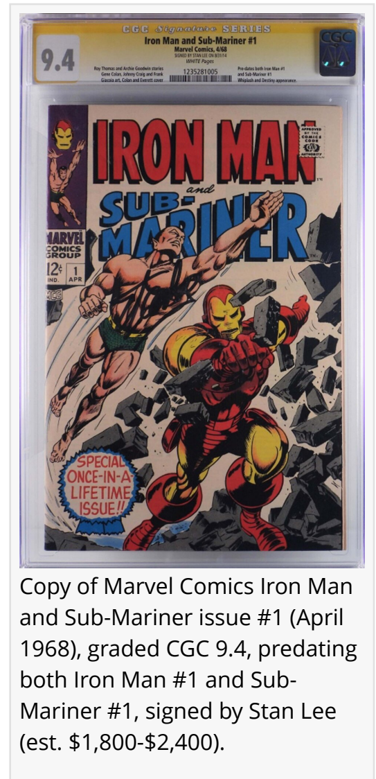
Copy of Marvel Comics Iron Man and Sub-Mariner issue #1 (April 1968), graded CGC 9.4, predating both Iron Man #1 and Sub-Mariner #1, signed by Stan Lee (est. $1,800-$2,400).