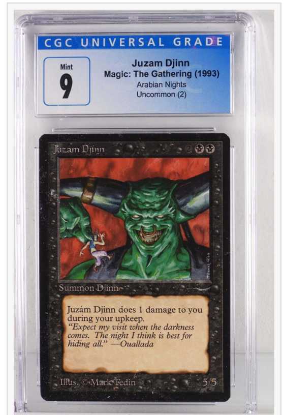
1993 Magic: The Gathering Arabian Nights Juzam Djinn trading card, graded CGC 9 Mint (est. $1,000-$1,500).

Travis Landry Bruneau & Co. Auctioneers +1 401-533-9980 email us here