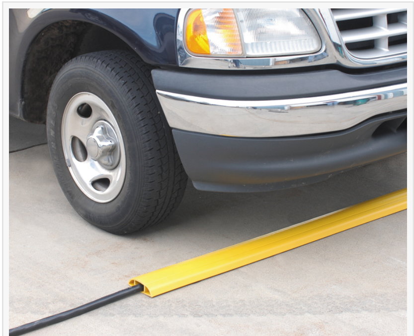
Flexiduct Cord Management

Easy Installation – ready to use, grounded AC duplex receptacles.