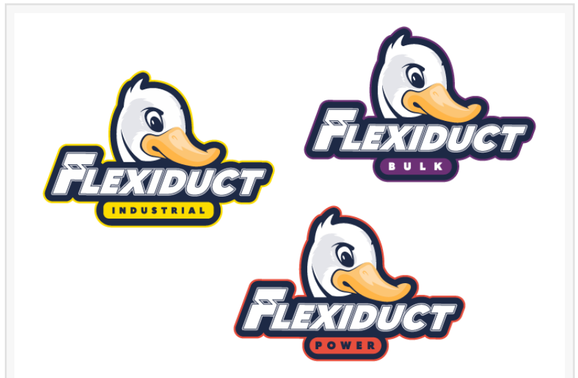
Flexiduct Cord Mgmt

management product to 5 other options including Industrial, Bulk, Power, Kit, and Safcord. Industrial offers heavy duty extension cord and cord cover combined into one unit, reducing hazards, protecting valuable cords and equipment, and ideal for heavy foot traffic and industrial