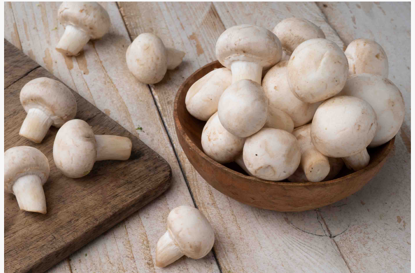
Global Button Mushroom Market

India accounted for 1,00,000 tonnes, 85% of which is accounted for button mushroom. Earlier the cultivation of button mushrooms was limited to the winter season only however, with the advancement in technology; the cultivation of mushrooms is possible throughout the year.