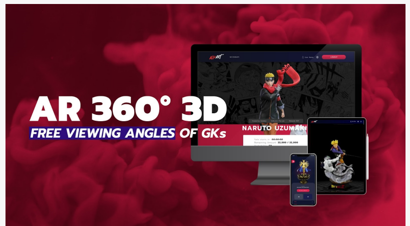
Top 3D/AR technology to scan and best present the anime figures