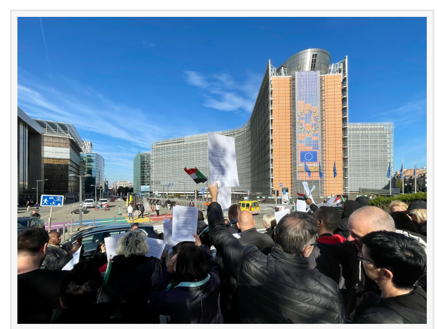
The European and Sudanese communities joined hands in a major protest in front of the European commission against General Al Burhan.

BRUSSELS, BELGIUM, October 4, 2022 /EINPresswire.com/ -- A total of some 150 demonstrators, spread over 3 hours, came to demonstrate at the headquarters of the European Commission this tuesday 4 October 2022 in the European capital of Brussels against the coup leader currently leading the government in Sudan. After the demonstration, a letter was also delivered to the External Action Service addressed to the High Representative of the European Union for Foreign Affairs and Security Policy, Mr. Joseph Borell. It was important to see that people also