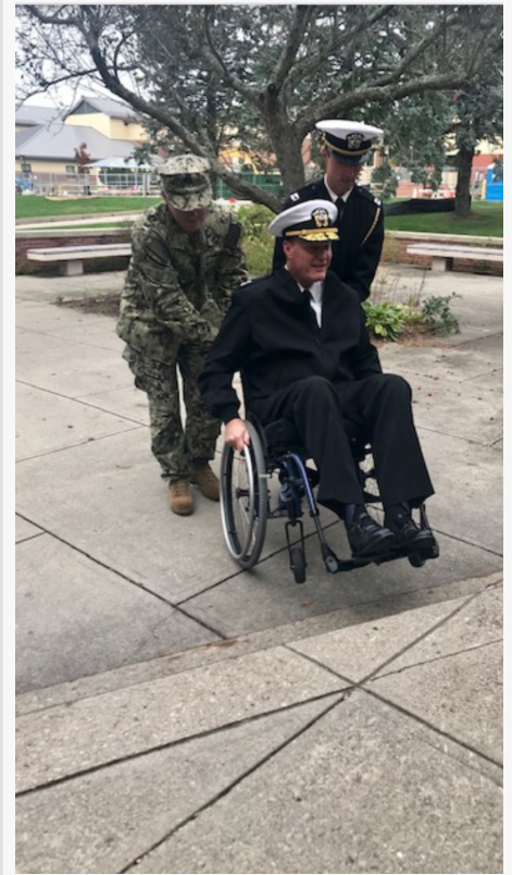
Rear Admiral Kyle Cozad

This press release can be viewed online at: https://www.einpresswire.com/article/594165961