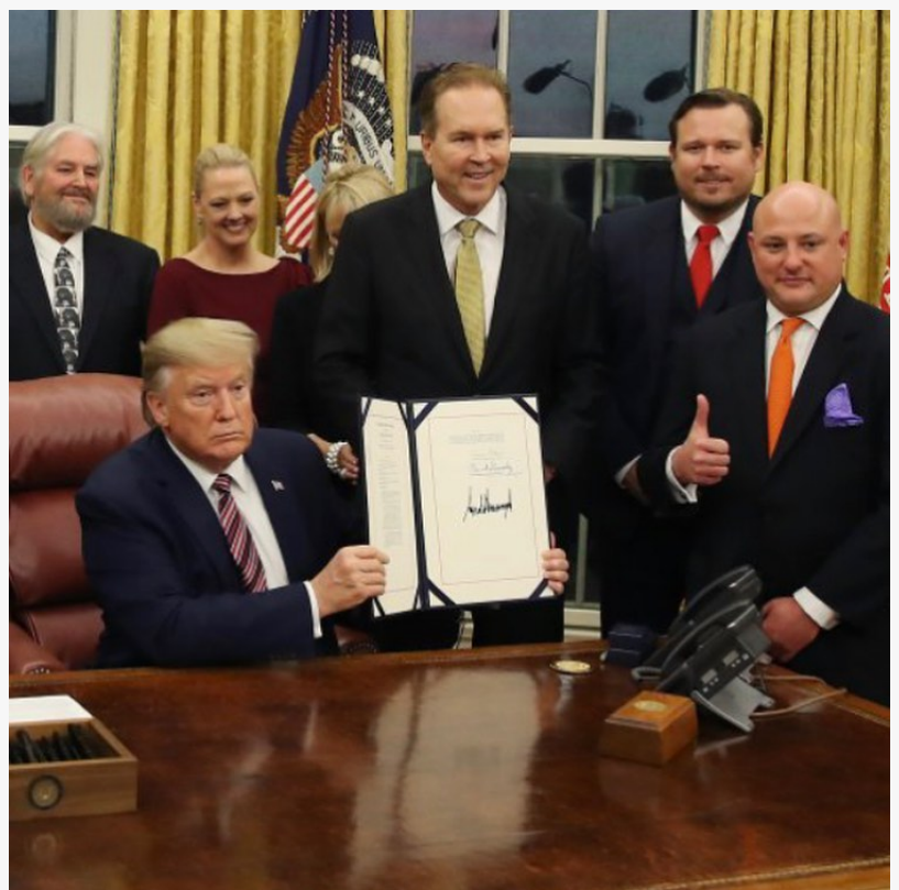
Rep. Vern Buchanan, Marty Irby, and former President Donald Trump at the signing of the PACT Act in November

"The FDA Modernization Act 2.0 will accelerate innovation and get safer, more effective drugs to