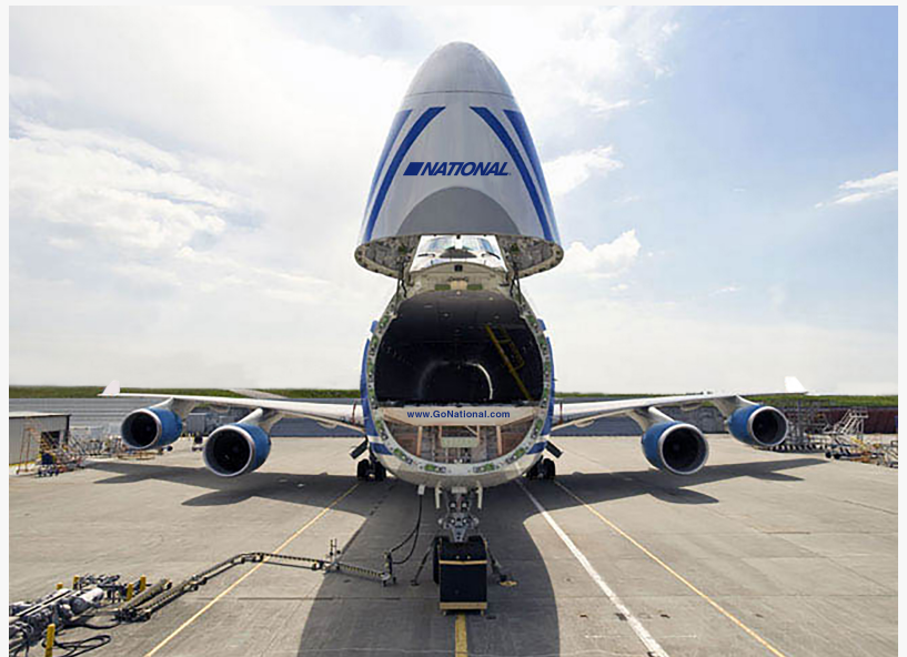
'Nose door' loading capability of B747-400F aircraft

"National further endorses our fleet modernization plans through the addition of an 8th B747-400F aircraft to offer robust cargo transportation opportunities to our customers. We believe