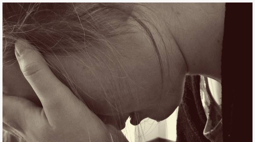
"National Depression and Mental Health Screening Month"

/EINPresswire.com/ -- Before celebrating "National Depression and Mental Health Screening Month" this October, the Florida chapter of the Citizens Commission on Human Rights (CCHR) urges people to investigate the liabilities of psychiatric screening for depression, ADHD, or other potentially normal behaviors labeled as disorders, especially in schools. [1]