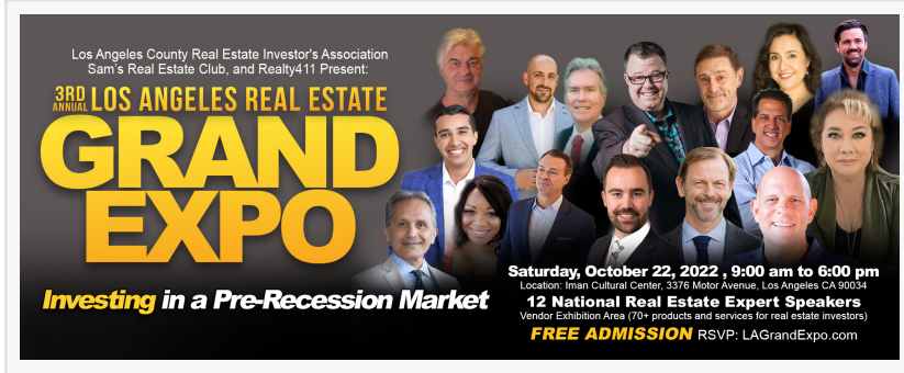
Grand Expo banner

INVESTMENT EDUCATION. Just think of it! An all-day in-depth educational extravaganza celebrating real estate investing. More importantly, this will NOT be a sales pitch. Each of the speakers have contractually agreed to educate and teach successful real estate investing strategies. So regardless of whether attendees are new investors, already own properties, or are very experienced, the Grand Expo is for you!