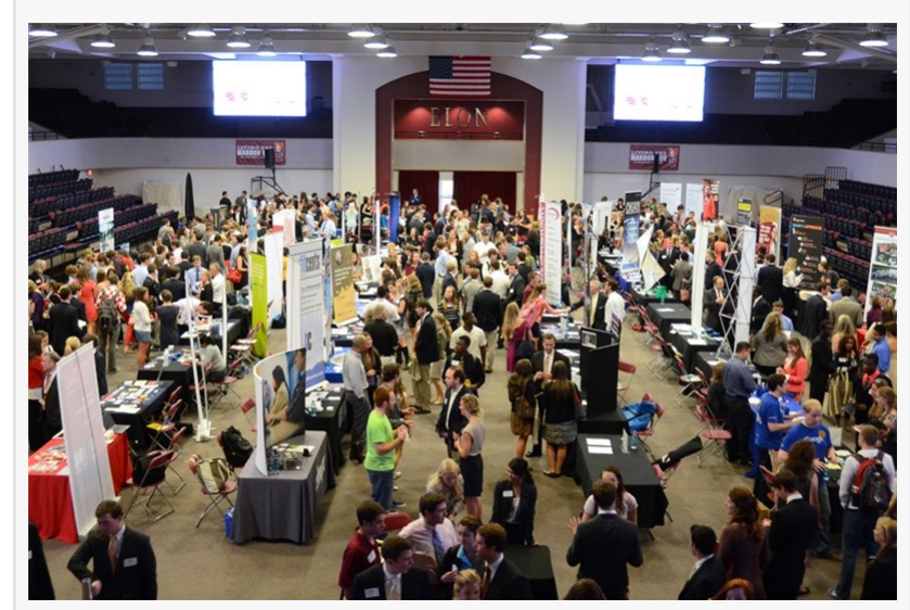
Grand Expo vendor area

COMPLIMENTARY PRIVATE CONSULTATIONS. As a special unique feature of this year's Grand Expo, investors can sign-up for private half-hour consultations with their favorite speakers. Registration will occur Saturday morning, starting promptly at 8:00 am. First come – first serve. So come early and schedule the private consultations. A once in a lifetime opportunity to get free advice from national real estate experts!