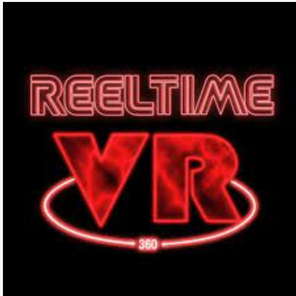
ReelTime VR Patent

Continuation patents allow the company or individual to expand upon their initial patent or to cover a market or technology more completely. This additional protection against valuable intellectual property allows companies to better protect themselves against patent infringement. With a more complete coverage of that initial technology or target market via a continuation patent, companies are less susceptible to invalidation during litigation procedures in court related to patent infringement cases. Additionally, continuation patents allow the company to protect the expansion of their ideas dating back to the submission date of the parent patent. For ReelTime's "Periramascope" Patent, this would be an initial patent application date of July 19,