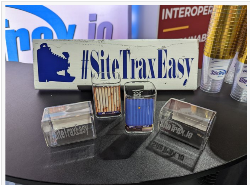
#SiteTraxEasy - Picture from SiteTrax by Netarus Booth at Intermodal EXPO 2022

LONG BEACH, CA, UNITED STATES, October 6, 2022 /EINPresswire.com/ -- SiteTrax™ by Netarus is pleased to announce that it was on hand to introduce its latest Intermodal Asset Tracking Release at the Intermodal Association of North America's ( IANA ) 2022 EXPO, which took place September 12-14 at the Long Beach Convention Center in Long Beach, California. SiteTrax is a container and chassis asset identification and data capture solution. In addition to demonstrating this cutting-edge technology at IANA, the SiteTrax by Netarus team presented Increase Intermodal Yard Visibility with Inexpensive OCR in the Dialogue Box.