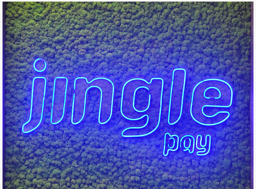
Jingle Pay Logo