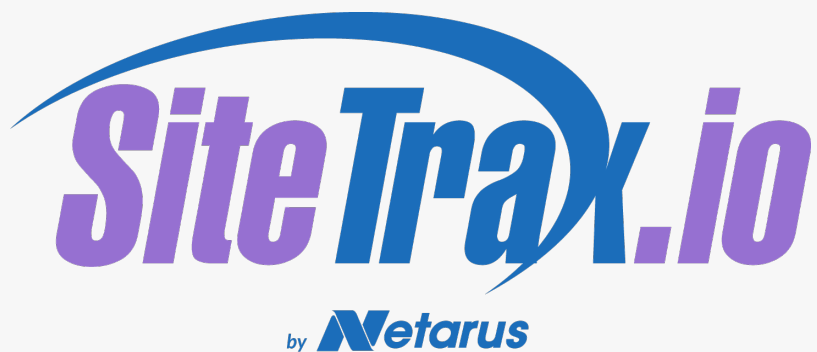
SiteTrax by Netarus