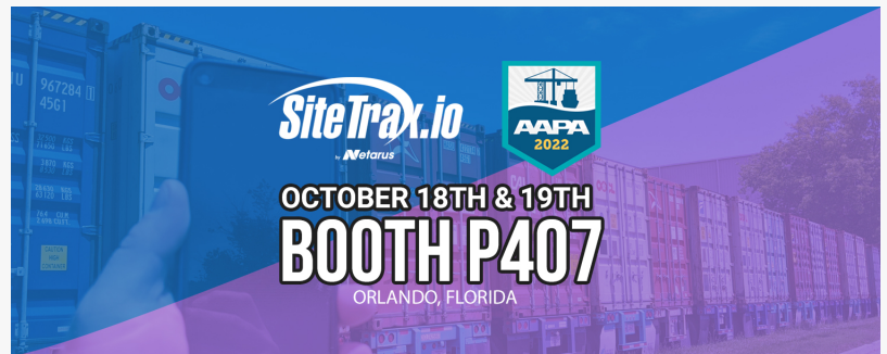
SiteTrax at AAPA 2022 Conference

SiteTrax provides a revolutionary tool for collecting asset IDs by significantly speeding up data collection over traditional methods. The asset IDs (i.e., intermodal containers or chassis) can be