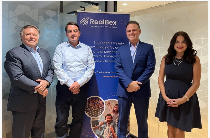
RealBex's external advisory board members during a recent meeting in Dubai