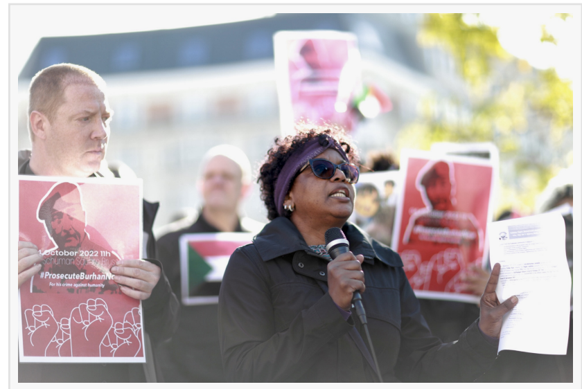
Children protesting in Sudan have been abused and unfairly detained. The authorities have blocked access to the internet and are endangering women's rights.

violated. Yes, the Sudanese deserve better. The Sudanese people are beginning to realise that something must change and that they will need a reconciliation figure to assist them to regain peace, unity, and power. As a global citizen, I regard the suffering of the Sudanese as an assault on my universal rights of we the people. A modern European president or government leader would never open fire on dissidents. Europeans think differently. Sudan's Al Burhan dictatorship has violated human rights and abused protestors; this must be exposed. Together, we want to persuade the Sudanese to have free and fair elections to form a