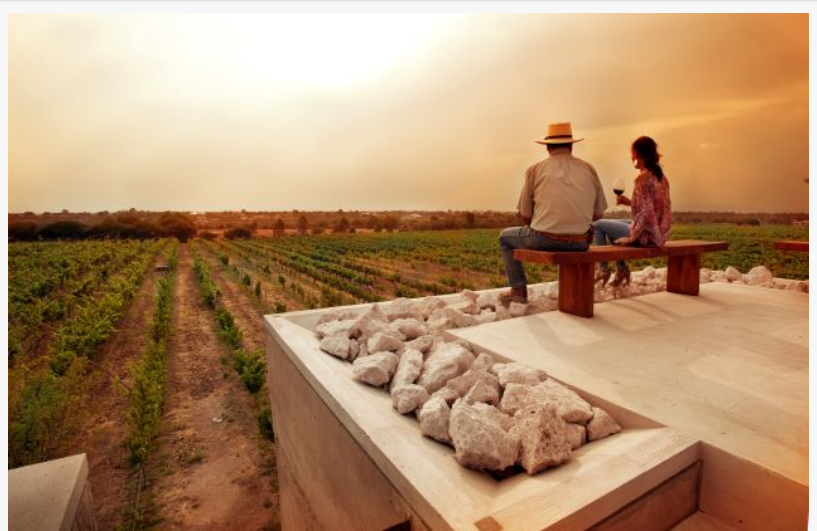
The Guanajuato wine region is vibrant and thriving