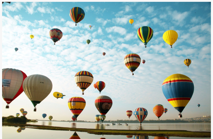
Guanajuato's International Hot Air Balloon Festival