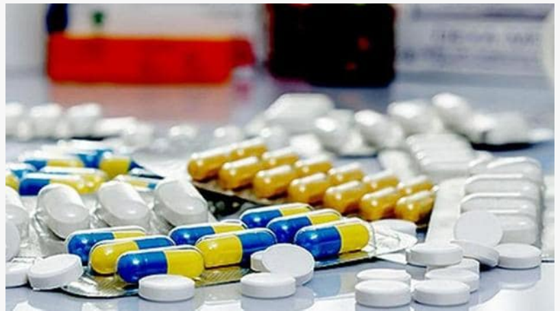
Generic Drugs Market

/EINPresswire.com/ -- The global Generic Drugs market accounted for USD 515.0 billion in 2020 and is expected to reach USD 1,042.1 billion by 2028, growing at a CAGR of around 9.4% between 2021 and 2028.