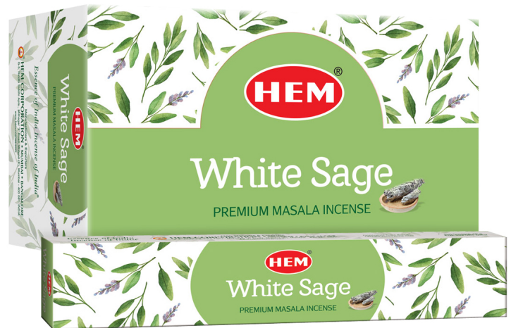
HEM White Sage Masala Incense Sticks

LOS ANGELES, CALIFORNIA, USA, October 6, 2022 /EINPresswire.com/ -- Aromatherapy is a practice being used since ages using incense, is a blissful option to de-stress your nerves. Being a leader amongst incense makers in the world, HEM has always stood for the quality of products that it offers to its consumers. Standing to the essence and soul for what the company is all about, HEM offers different rejuvenating fragrances to suit every mood and uplifts your mood instantly. HEM brings four splendid incense sticks that are just right for a soul soothing aroma session alone or with your companions. White Sage, Sandalwood, Aroma Collection & Lavender Incense sticks have a tranquilising aroma when spreads in the direction of the wind cleanse your surroundings of negative energy while leaving you refreshed and energised.