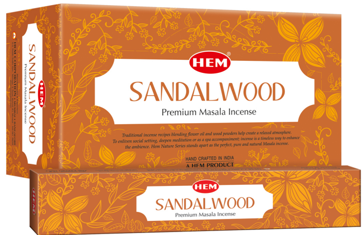
HEM Sandalwood Incense Sticks