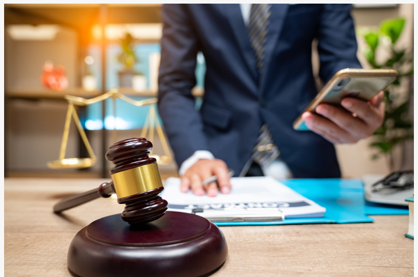
Legal Transcription Market

/EINPresswire.com/ -- According to analysts at Zion Market Research, the global Legal Transcription market accounted for USD 4,508.6 Million in 2020 and is expected to reach USD 9,958.1 Million by 2028, growing at a CAGR of 11% from 2021 to 2028.