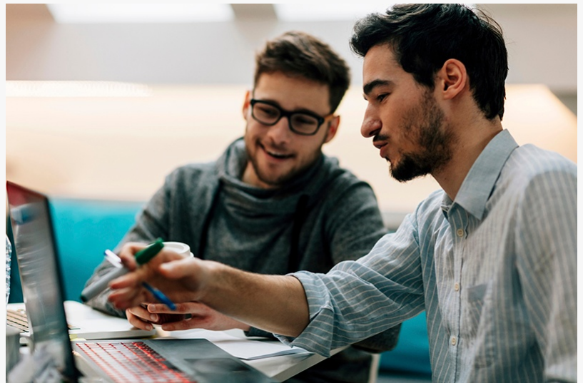
Cloud Based Collaboration Software Market

/EINPresswire.com/ -- According to analysts at Zion Market Research, the global cloud-based collaboration software market accounted for USD 4.67 Billion in 2020 and is expected to reach USD 11.26 Billion by 2028, growing at a CAGR of 11.88% from 2021 to 2028.