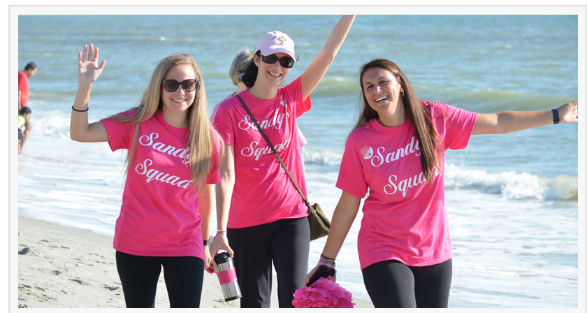
Participants walk on the beach during a previous 5k Beach Walk.

Since 1993, the American Cancer Society Making Strides Against Breast Cancer® campaign has united communities, companies, and individuals with a collective goal to end breast cancer as we know it. Over the past two decades, the 3- to 5-mile noncompetitive walks have collectively grown into the nation's largest and most impactful breast cancer