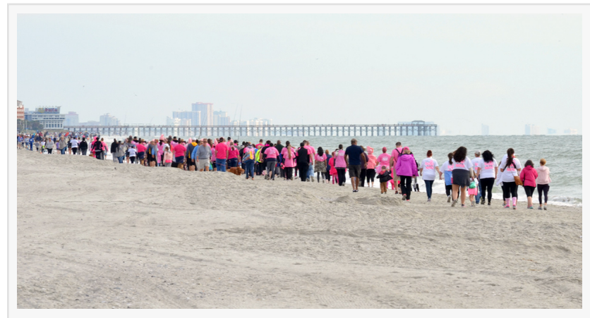
Hundreds walk down the beach in Myrtle Beach during a previous Beach Walk.

Dollars raised help the American Cancer Society fund innovative breast cancer research; provide education and guidance to help people reduce their risk, and offer comprehensive patient support to those who need it most.