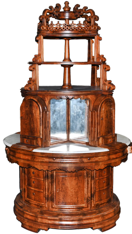
Circular bank/hotel foyer cabinet by Phillip Kopp, 105 inches tall and 63 inches in diameter, made in 1850 from burl walnut, a two-tiered cabinet, having four sections of white marble with mirrors.

Jason Woody Woody Auction +1 316-747-2694 email us here