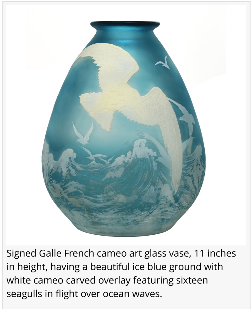
Signed Galle French cameo art glass vase, 11 inches in height, having a beautiful ice blue ground with white cameo carved overlay featuring sixteen seagulls in flight over ocean waves.