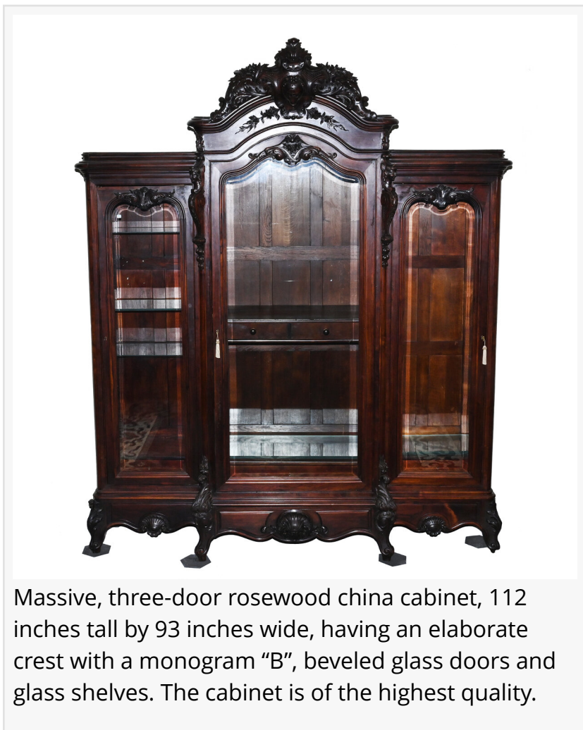
Massive, three-door rosewood china cabinet, 112 inches tall by 93 inches wide, having an elaborate crest with a monogram "B", beveled glass doors and glass shelves. The cabinet is of the highest quality.

Woody Auction is always accepting quality consignments for future sales. To consign a single item, an estate or an entire collection, please call (316) 747-2694; or, you can send them an email, to info@woodyauction.com . To learn more about Woody Auction and the antique auction scheduled for Saturday, October 29th at 9:30 am Central, please visit www.woodyauction.com . Updates are posted often.