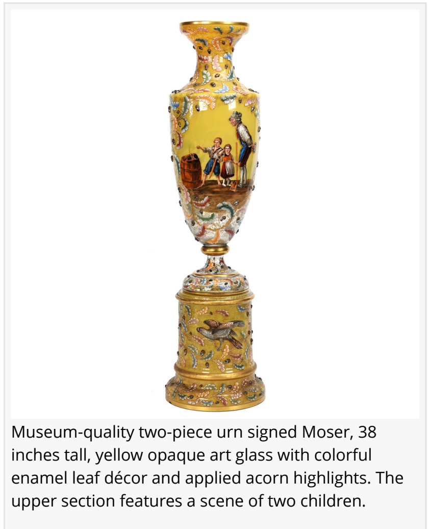
Museum-quality two-piece urn signed Moser, 38 inches tall, yellow opaque art glass with colorful enamel leaf décor and applied acorn highlights. The upper section features a scene of two children.

Yet a third signed Galle French cameo art glass vase, this one a 9 ½ inch tall blown mold example, doesn’t carry the lofty estimates of the other two, but is just as beautiful. It features a clematis design with yellow and white ground amber cameo cutback overlay. Also up for bid is a museum-quality two-piece urn signed Moser, 38 inches tall, incredibly rare yellow opaque art glass with extensive colorful enamel leaf décor and applied acorn highlights. The upper section features a scene of two children.