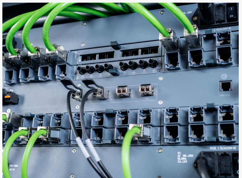
Industrial Ethernet Market