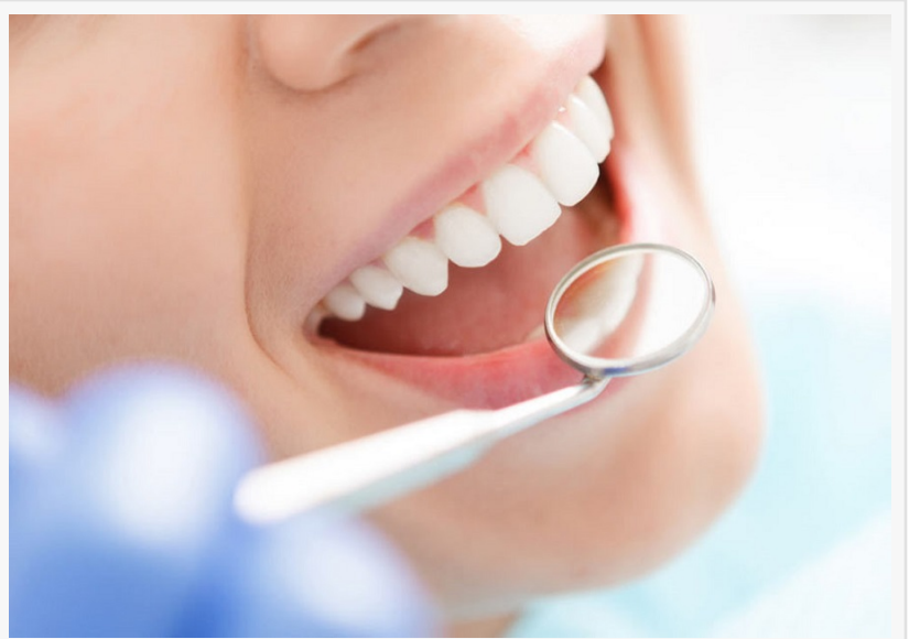
Global Dental Hygiene Market

Oral hygiene helps in prevention of cavities and improves oral health. Consistent cleaning of teeth from the dentist is very essential to remove plaque that develops even after daily brushing of the teeth. Bad breath known as halitosis, tooth erosion, tooth decay, tooth sensitivity, oral cancer, mouth sores are some of the major dental problems observed among people. Dental hygiene devices are used in the diagnosis and cure such dental conditions.