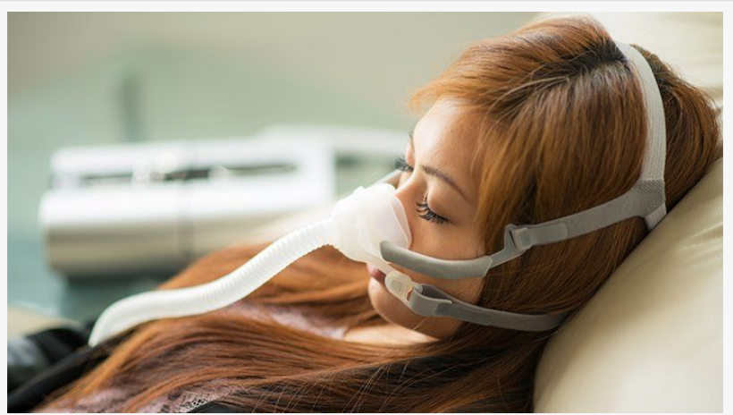
Global Sleep Tech Devices Market

sleep pads, headbands, beds and ear plugs. Over the past couple of years, sleep enhancement applications have seen major developments that have revolutionized the sleep tech industry. Besides tracking sleep, newly developed advanced sleep tech devices can also control temperatures that might otherwise disturb sleep. The easy availability of such improved sleep devices will have a positive impact on sleep tech product market growth.