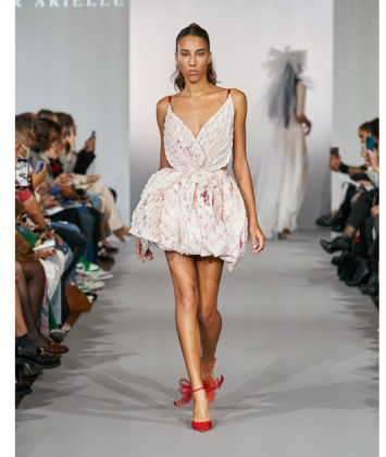
Dryden Sereda / Atelier Arielle