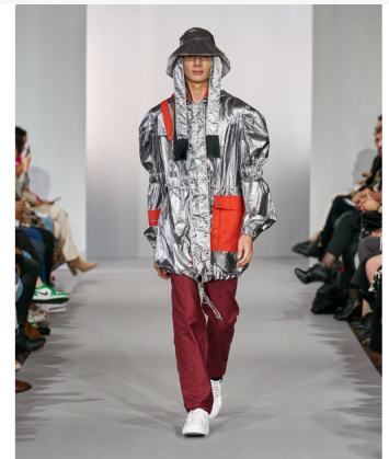
Un Crie de Joie