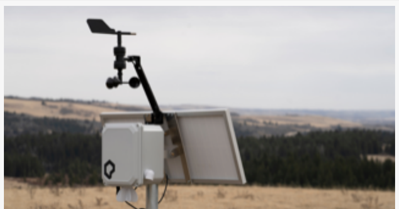
Qube Axon Device

HOUSTON, TEXAS, UNITED STATES, October 11, 2022 /EINPresswire.com/ -- Qube Technologies (www.qubeiot.com) , a leader in environmental surveillance technology, today announced that Birch Permian has chosen the company as their preferred continuous monitoring technology vendor and will expand their current Qube deployment to all operated horizontal well facilities.