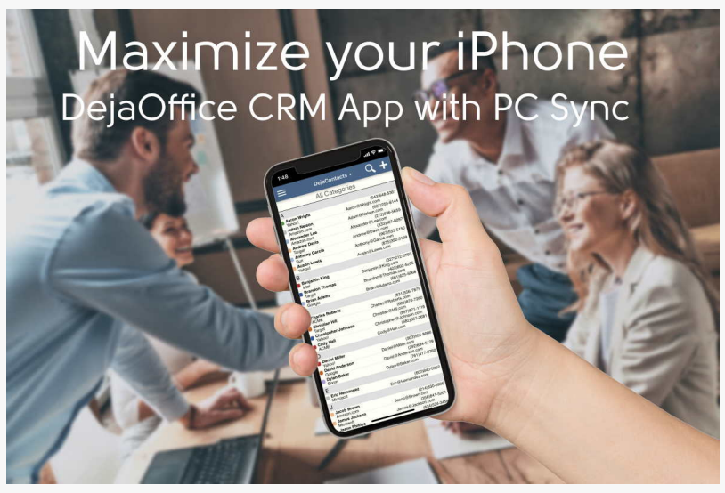
Maximize your Productivity with DejaOffice CRM App for iPhone