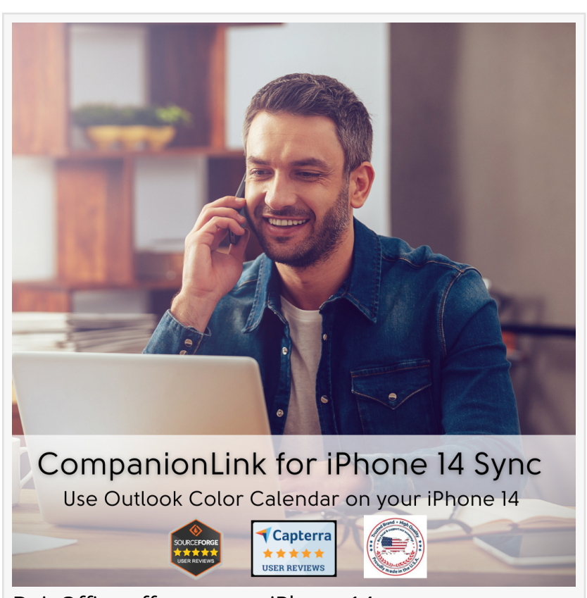
DejaOffice offers secure iPhone 14 sync

Customers have been increasingly wary of Google, which profits from advertising and selling aggregated customer data. In addition, Microsoft