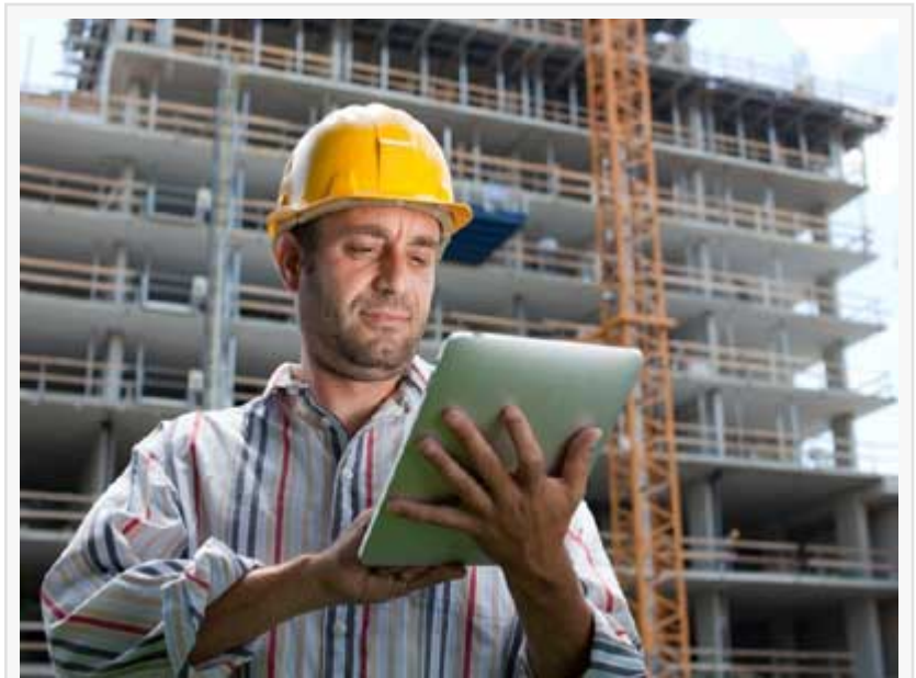
Asset Management Software