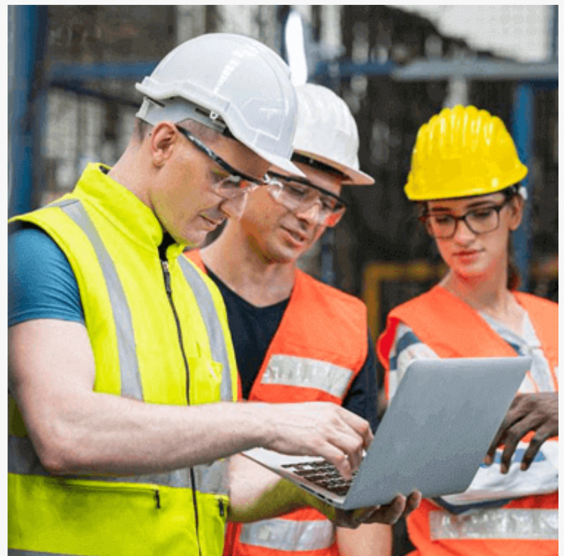
Team using CMMS

A: mAPI is a proprietary Maxpanda API software specifically developed to securely transfer data from your Maxpanda CMMS database to other software that also operate on highly secure API web protocols. Join millions of people like you who seek to manage their work orders online,