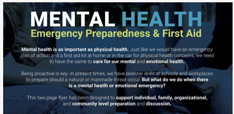
Mental Health Emergency Preparedness and First Aid Flyer

/EINPresswire.com/ -- In the face of the growing global mental health crisis, ReVision Youth announces the launch of the Mental Health Emergency Preparedness and First Aid campaign.