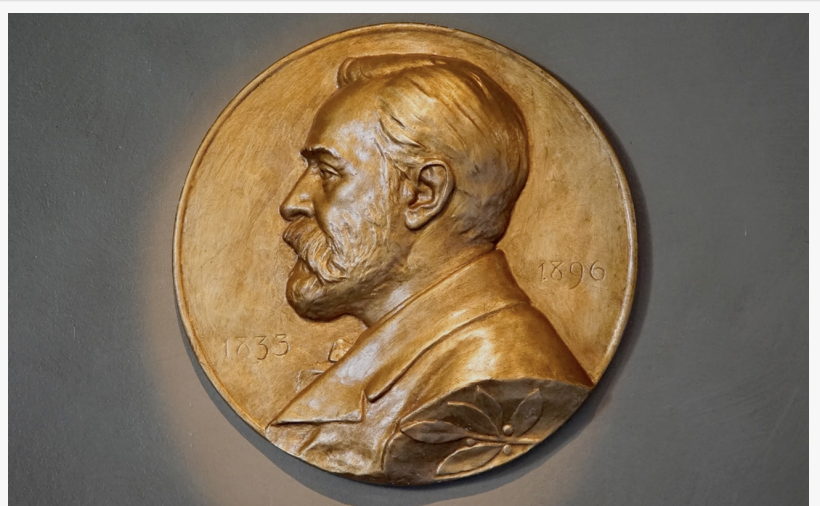
Nobel Prize in Chemistry for C60 Molecule