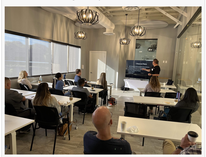
R3 Medical Training Classroom